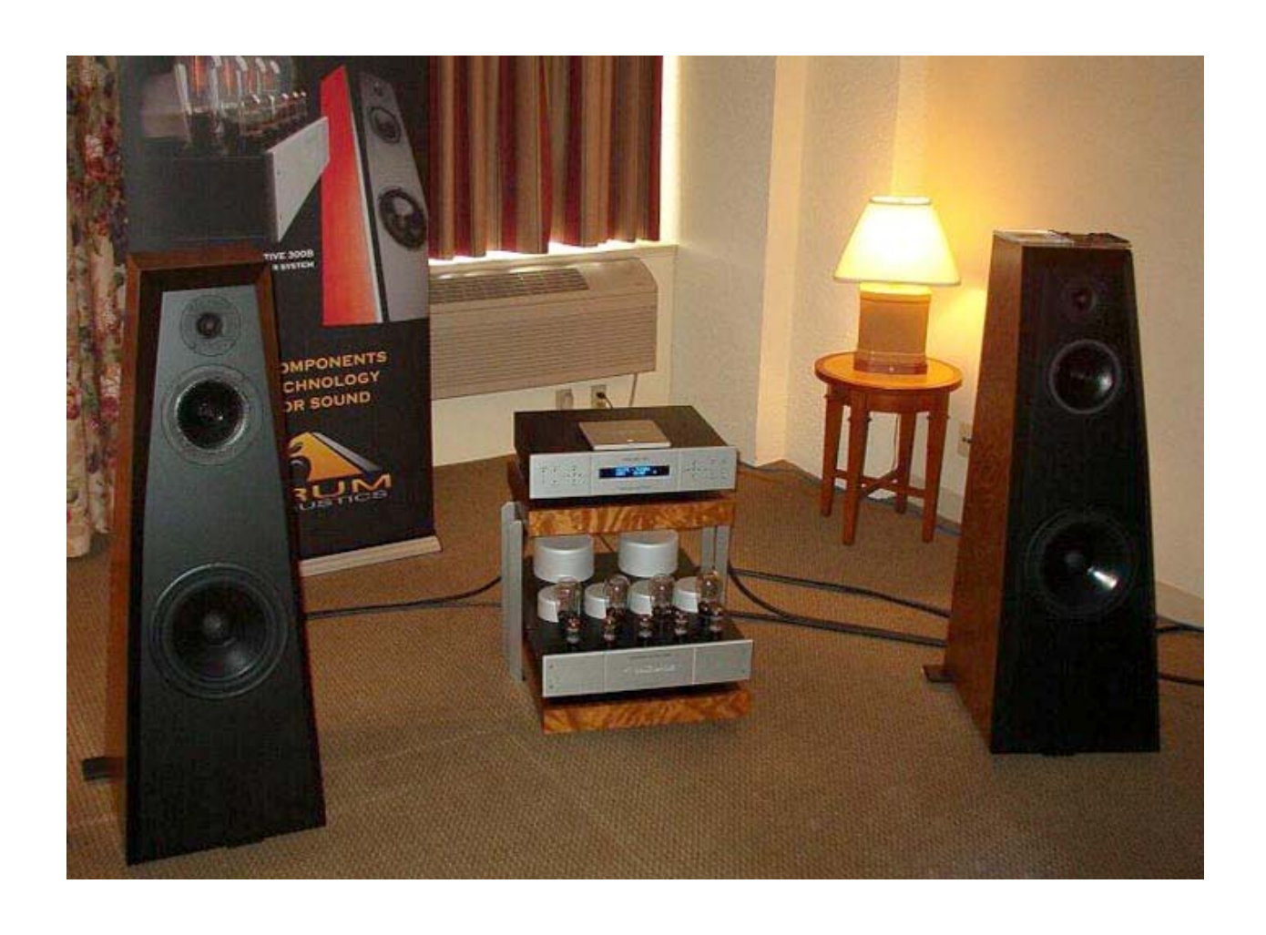
Candy, P. (2006, April) Industry Feature. sixmoons.com . Retrieved April 18, 2006 from http://www.6moons.com/industryfeatures/montreal06/montreal_2.html